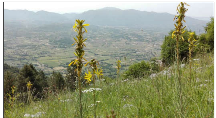
Photo 7. Asphodeline lutea flowering in the sub-Mediterranean grasslands in the "oceanic" part of our study gradient (submontane belt, Lazio sector).

In the subalpine belt (that will not be reached by our expedition) most slopes are covered with communities dominated by Festuca circummediterranea , F. laevigata subsp. laevigata , F. sect. Aulaxyper , Avenula praetutiana , Koeleria lobata and Poa alpina . On shallower soils, the subalpine grasslands are dominated by Sesleria juncifolia subsp. juncifolia (Primi et al. 2016).