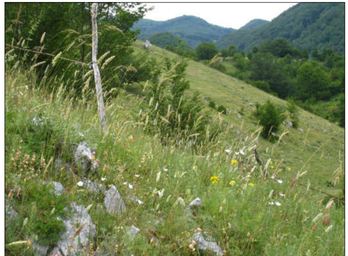
Photo 5. The relatively oceanic, sub-Mediterranean slopes of the submontane belt in the Lazio Apennines: grassland patch with Bromus erectus , Koeleria splendens , Phleum hirsutum subsp. ambiguum , Erysimum pseudorhaeticum , Artemisia alba , Silene otites , Anthyllis vulneraria , etc.

Estimated costs: 660 Euros , including accommodation (sharing twin rooms), full meals (from dinner of the first day to breakfast on the last day), ground transport from arrival at Rome Fiumicino airport until departure from the same place (participants arriving by train to Roma Termini railway station can easily reach the airport by shuttle train “Leonardo Express”). The exact price will be confirmed later to those who will place a pre-registration (we are currently negotiating some financial support, so we might be able to reduce it by c. 100 Euros). It is also possible to apply for financial support for participation (travel grants, see below), although this requires membership of the IAVS.