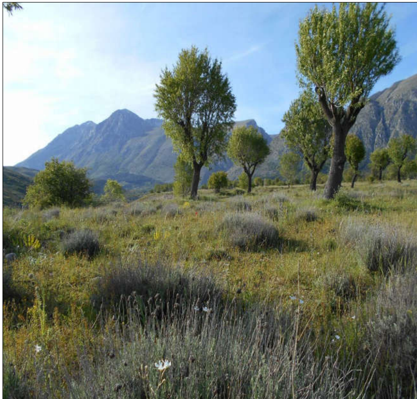
Photo 10. Old almond grove in a dry valley (Fucino basin) now used as extensive pasture and encroached with Helichrysum italicum .

Idoia Biurrun, Bilbao, Spain idoia.biurrun@ehu.es