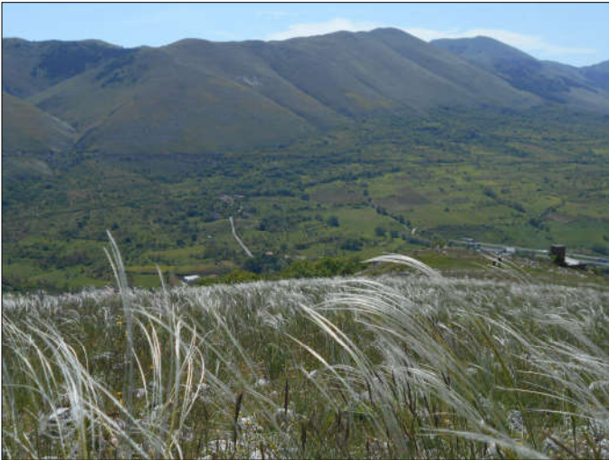
Photo 3. A grassland dominated by Stipa dasyvaginata subsp. apenninica (foreground) near Pescina (where we will stay on the first 4 nights), in the low-rainfall section of the study transect. In the background, above the cultivated valley bottom, the mountain slopes are covered with chamaephyte-rich grasslands (the yellow patches are massive carpets of Helianthemum oleandicum subsp. incanum ).