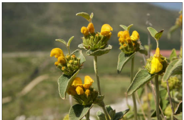
Photo 2. Phlomis fruticosa , an Eastern-Mediterranean species found as a xerothermic relict near Pescina in the Fucino basin.