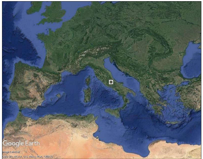
Fig. 1. Study area position (white square).

The main research aim will be sampling plant richness patterns across a continentality gradient. Because of rain-shadow effect, some inner valleys of Abruzzo (e.g. the Fucino basin and the Aterno valley) feature low precipitation values. This situation is somewhat similar to the well-known “dry valleys” of the Alps (e.g. Schwabe & Kratochwil 2004; Wiesner et al. 2015), but while in the Alps the precipitation regime is centred in summer, in the Central Apennines there is a sub-Mediterranean climate with summer drought or at least with a summer rainfall minimum (Gerdol et al. 2008; Blasi et al. 2014). The grassland vegetation in these Apennine inner basins is made up of a very interesting mixture between steppic (e.g. Stipa capillata , Sideritis italica , Crocus reticulatus , Androsace maxima , Linum austriacum subsp. tommasinii ) and Mediterranean (e.g. Artemisia alba , Convolvulus elegantis-