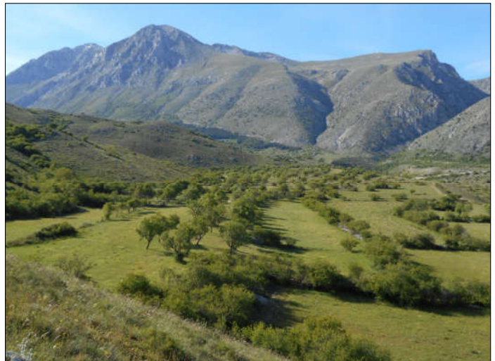
Photo 1. Apennines “dry valleys”: old almond groves and pastures in the Fucino basin, at the foothills of Monte Velino massif.