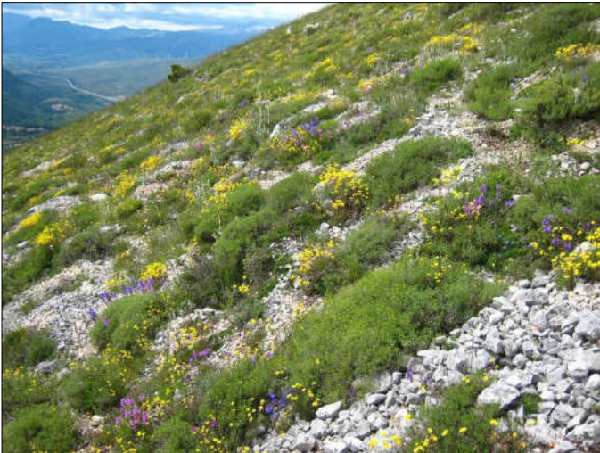
Photo 6. A stony slope in the dry sector of the Marsica range, with an open formation dominated by chamaephytes such as Satureja montana , Sideritis italica , Helianthemum oleandicum subsp. incanum , Globularia spp., and with Polygala major , Bromus erectus , Koeleria splendens , etc.

subsp. apenninica , Sideritis italica (= S. syriaca p.p.) (e.g. Tammaro 1984). Here also some very disjunct populations of rare steppic species occur, the most striking being Goniolimon italicum , a narrow endemic known solely from the L'Aquila basin and the only W-European species of a typically steppic genus (Morretti et al. 2015); other examples of disjunct populations include (see e.g. Tammaro 1995; Conti & Bartolucci, 2015) Androsace maxima , Crocus reticulatus , Alyssum desertorum , Salvia aethiopsis and Astragalus exscapus : the latter was until now known in Italy for the Alpine dry valleys only, and has been discovered for the first time in the Apennines in 2016 (Cancellieri et al., in prep.) during a preparatory field trip for this EDGG Workshop! Interestingly, intermixed with these steppic taxa there is often a number of Mediterranean species: e.g. Helichrysum italicum , Salvia argentea , Stipa capensis . The stony slopes are often colonized by grasslands rich in chamaephytes ( Satureja montana , Globularia spp., Helianthemum spp., Thymus longicaulis , Chamaecytisus spinescens etc.) or even pseudo-garrigues (Pirone & Tammaro 1997). Some grasslands are encroached with E-Mediterranean small shrubs such as Phlomis fruticosa , Salvia officinalis , Daphne sericea .