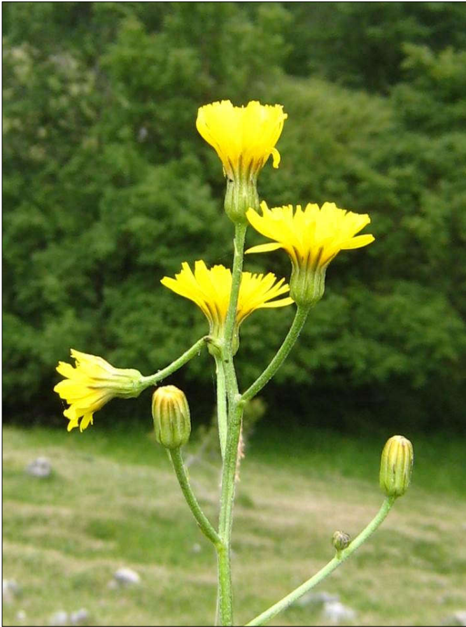
Photo 8. Crepis lacera (endemic to Italy and typically found in montane and submontane grasslands).

Especially at lower elevation, secondary grasslands are rich in orchids: many of them are of conservation interest, such as Himantoglossum adriaticum , Epipactis atrorubens , Ophrys apifera , Orchis pauciflora , O. provincialis , O. tridentata , O. ustulata . Endemic species include e.g. Crepis lacera (very common), Iris marsica , Paeonia officinalis subsp. italica , Viola eugeniae (Conti & Bartolucci 2015).