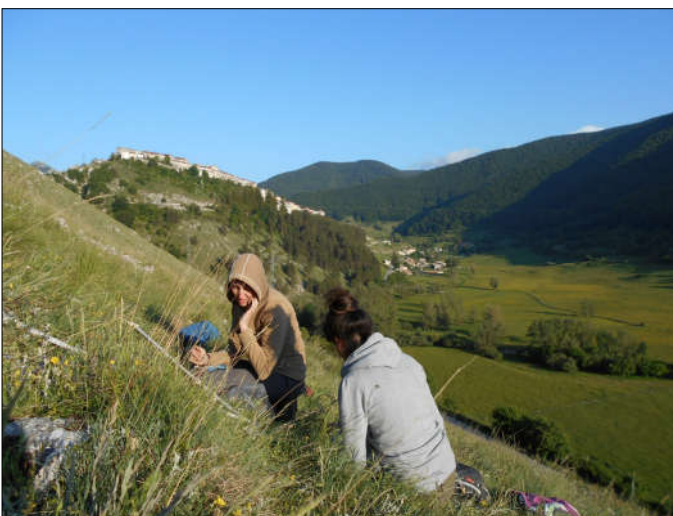
Photo 4. A goat-grazed grassland on steep limestones at 1100 m a.s.l. in a high-rainfall sector of the study gradient, near the hilltop village of Opi (where we will stay on the last 4 nights) in Abruzzo.

There are 13 available places (in addition to the organizers) to join this research workshop. Participants from any country and any academic level (BSc student to professor) are welcome. We particularly appreciate the participation of people experienced in any of the following fields: bryophytes or lichens identification; identification of critical vascular plants; experience in high-quality field sampling; advanced statistical methods for biodiversity patterns; zoologists who are willing