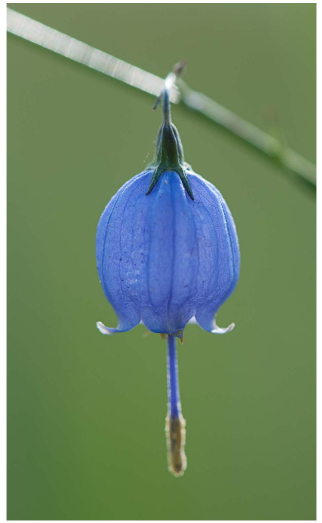
Adenophora cf. stenanthina. (JD134065)