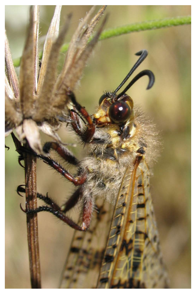
Palpares libelluliodes.