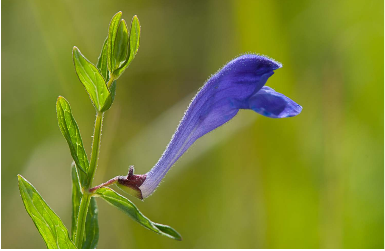
Dracocephalum peregrinum.

Annual Meeting of the British Ecological Society (BES) and the Société Française d'Ecologie (sfe) 9–12 December 2014, Lille, France http://www.britishecologicalsociety.org/events/ current_future_meetings/2014-annual-meeting/