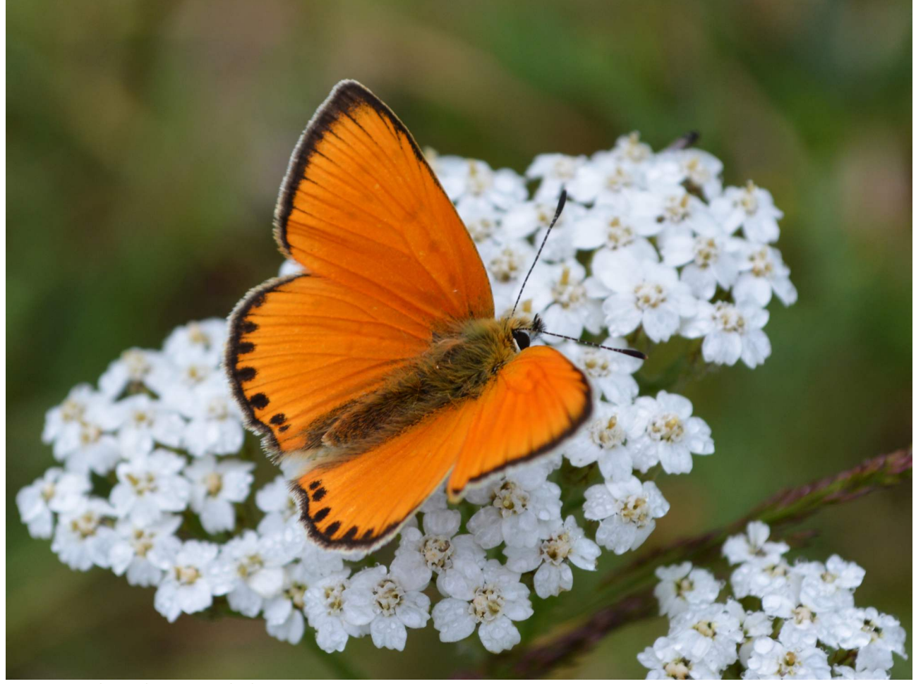
Lycaena italica.