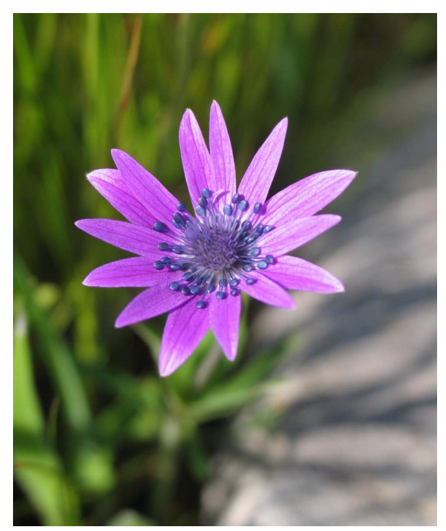
Anemone hortensis.