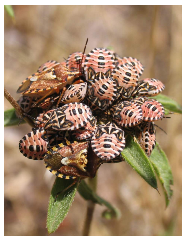
Codophila varia.