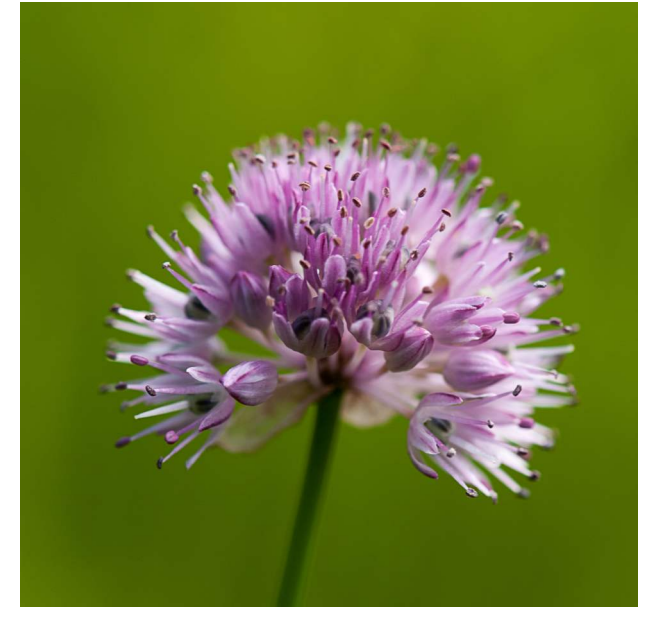
Allium stellerianum. Photo: J. Dengler (JD133814)