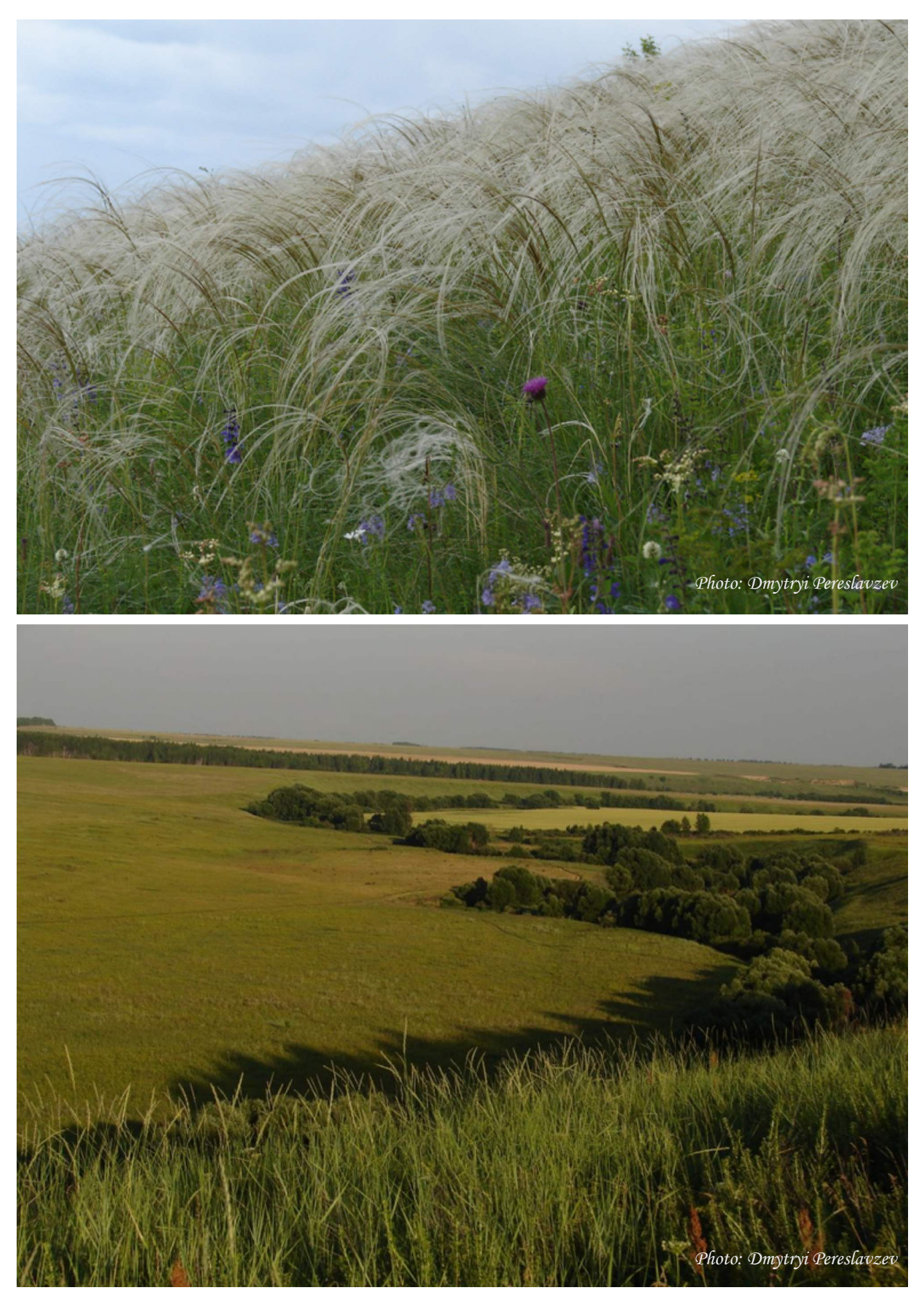
The photos and the picture on pages 4 and 5 come from the competition of creative works about the Kulikovo field <u>http://www.kulpole.ru/events/konkurs_kovil/raboty/</u>