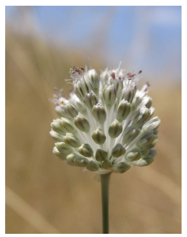
Allium gutatum.