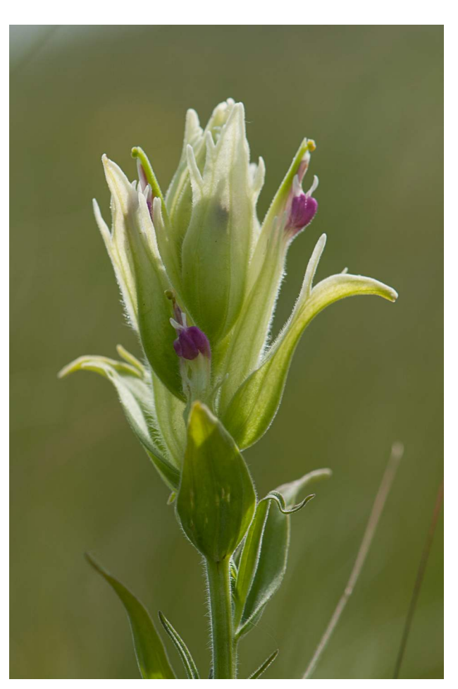
Castilleja palida. Photo: J. Dengler (JD133846)