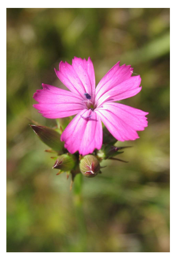
Dianthus balbisii.