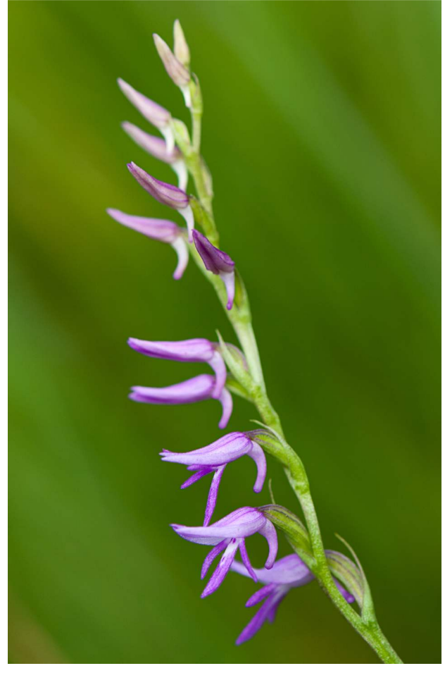
Neottianthe cucullata.