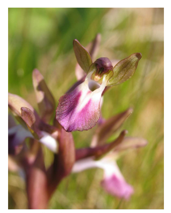
Neotinea collina.