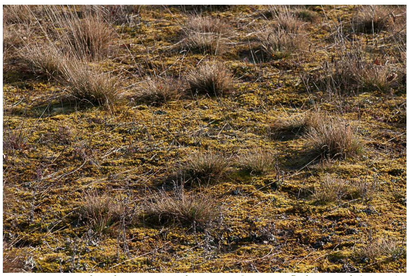
Pre-spring aspect in a Koelerion glaucae community in the nature reserve "Mainzer Sand". Photo: J. Dengler (JD140053)