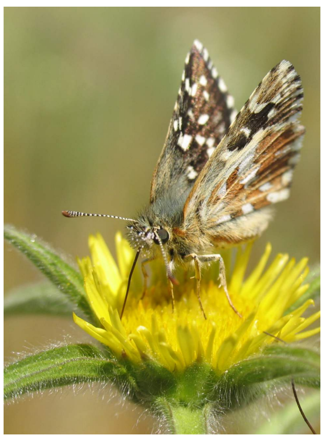
Pyrgus malvoides.