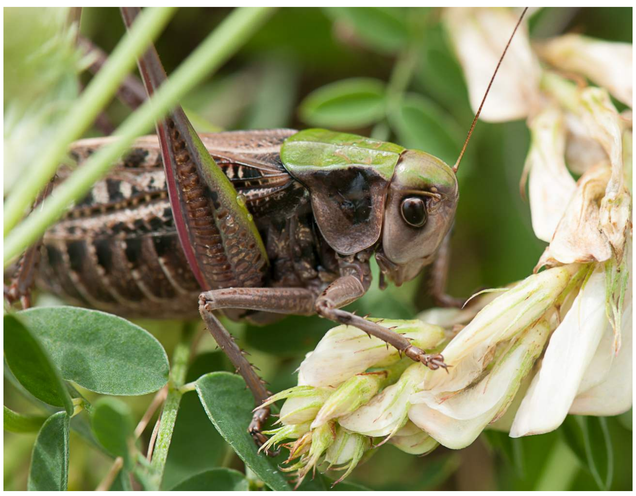
Decticus verrucivorus on Hedtsarim gmelinii. Photo: J. Dengler (JD 134244)