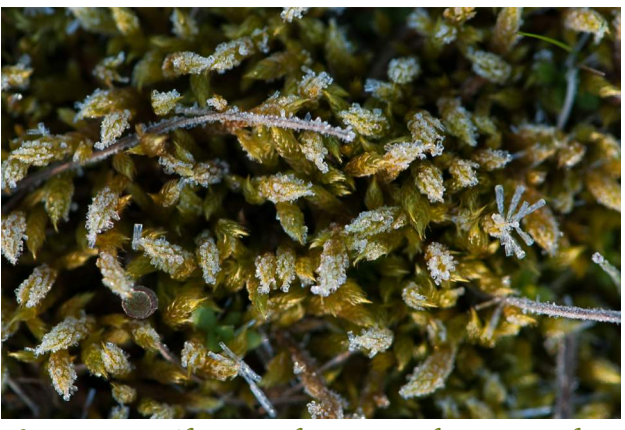
Hypnum cupressiforme var. lacunosum.