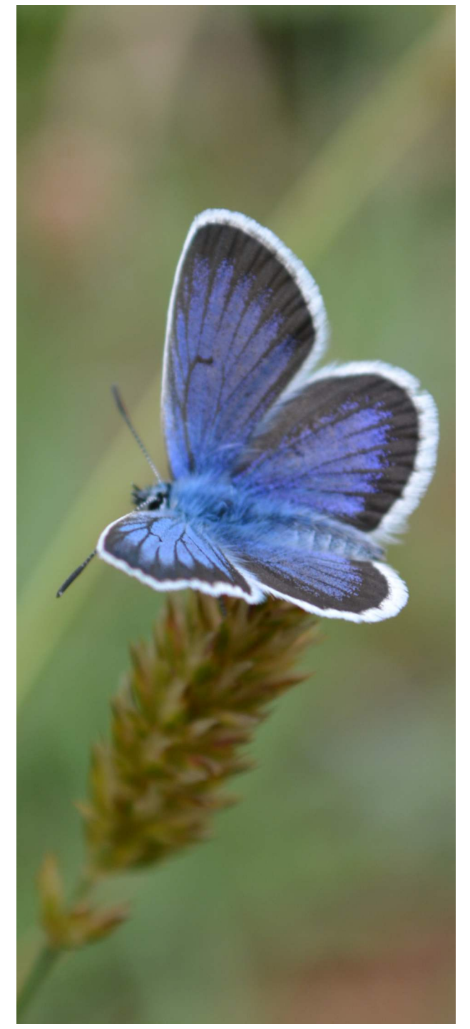
Plebejus argus.

Early in 2014, EDGG surpassed the threshold of 1000 members. As of 8 March 2014 we had 2013 members from 61 countries. The countries with the highest number of members are Germany (235), Greece (128), Poland (58), Russia (53), Italy (47), Ukraine (45) and Hungary (40). By contrast, the highest density of EDGG members in the population is found in Greece (11.7 members per 1 million inhabitants), followed by Estonia (9.6) and Slovakia (6.9).