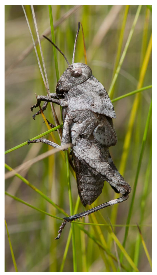
Siberian grasshopper species (cf. Prionotropis sp.).