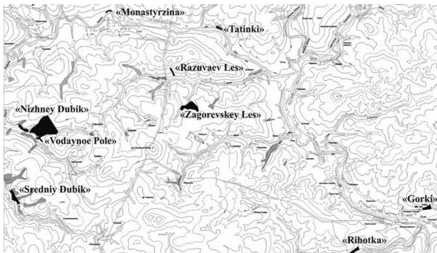
Fig. 1. The Location of Excursion Sites at Kulikovo Field (Tula Region)

pinnatum , Carex montana , Brachypodium pinnatum , Campanula persicifolia , Carex montana , Laserpitium latifolium , Anthericum ramosum , Lilium martagon , Adenophora lilifolia , Veratrum nigrum . The steppe vegetation (30 ha) is represented by 2 associations. Gentiano cruciatae–Stipetum pennatae and Stachyo rectae–Echinopetum ruthenicum with Adonis vernalis , Centaurea sumemsis , Anemone sylvestris , Iris aphylla , Gypsophila altissima , Linum flavum , Artemisia austriaca , Asperula cynanchica , Carex humilis , Scabiosa ochroleuca , Thymus marschallianus , Veronica jacquinii , Veronica spicata . The flora counts 275 species of vascular plants and 12 species of mosses.