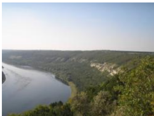
Fig. 3: Dniester River valley.