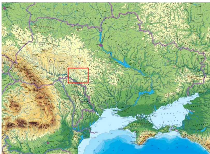
Fig. 1: Central Podilia at the physiographic map of Ukraine.

Podilia is the historical and geographical region of Ukraine that is situated between the rivers Pivdenny Bug and Dniester. According to the political division of Ukraine, it occupies the regions Khmel'nitski, Ternopol, and Vinnitsa as well as small parts of the regions Cherkassy, Kirovograd, and Odessa. Geomorphologically, the area corresponds to the Podilia Upland. Central Podilia is the central part of the Upland in the borders of Vinnitsa region, with altitudes about 200–300 m a.s.l. The climate is temperate, moderately continental with a mean annual temperature of 7–9 °C and a mean annual precipitation of 550–650 mm. Typical soil types are chernozem and podzol. In the geobotanical zonation of Ukraine, the territory corresponds to the Central-Podilian geobotanical district of the oak and hornbeam-oak forests as well as steppe-meadows.