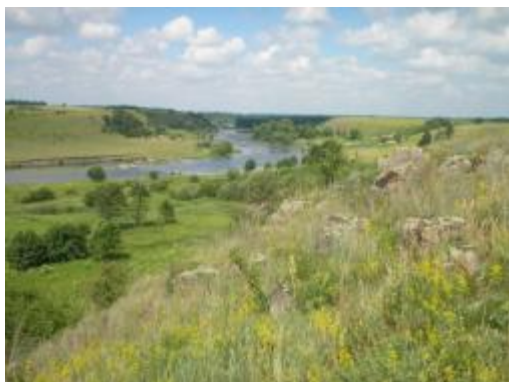
Fig. 2: Pivdenny Bug River valley.

Central Podilia is characterized by great diversity of dry grasslands, including vegetation of stony outcrops, particularly the granite outcrops of the Ukrainian Crystalline Shield in the Pivdenny Bug River valley (order Trifolio arvensis-Festucetalia ovinae , class Koelerio-Corynepherea ) and the limestone outcrops in the Dniester River valley (order Alyso-Sedetalia , class Koelerio-Corynepherea ). At the slopes of the both valleys, various types of steppe vegetation are widely distributed (alliances Festucion valesiaca and Cirsio-Brachypodium pinnati , class Festuco-Brometea ), with the dominance of Stipa capillata , S. lessingiana , S. pulcherrima , Botriochloa ischaemum , and Carex humilis . There are also small patches of forest-edge vegetation (class Trifolio-Geranietea ).