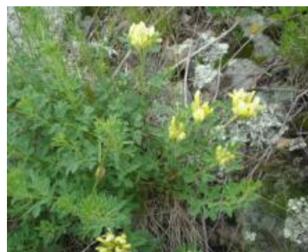
Fig. 5: Chamaecytisus blockianus .