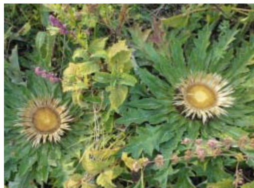
Fig. 4: Carlina onopordifolia .